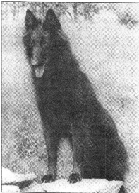
Belgian Sheepdog (Groenendael)

Then came the Great Depression and its devastating effect on everything, including dog