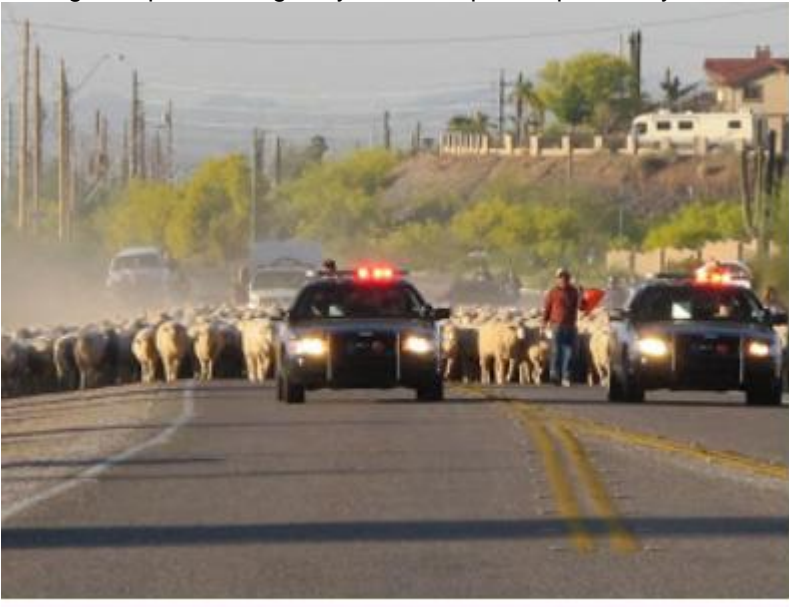
April 18, 2011 Heber-Reno Sheep Trail in Arizona

Once in the pasture, the dog watched the sheep or cattle and kept them in the graze