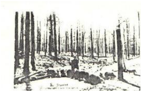
Berger avec ses moutons dans le Bois de la Cambre. De chaque côté du troupeau, un Laekenois veille.