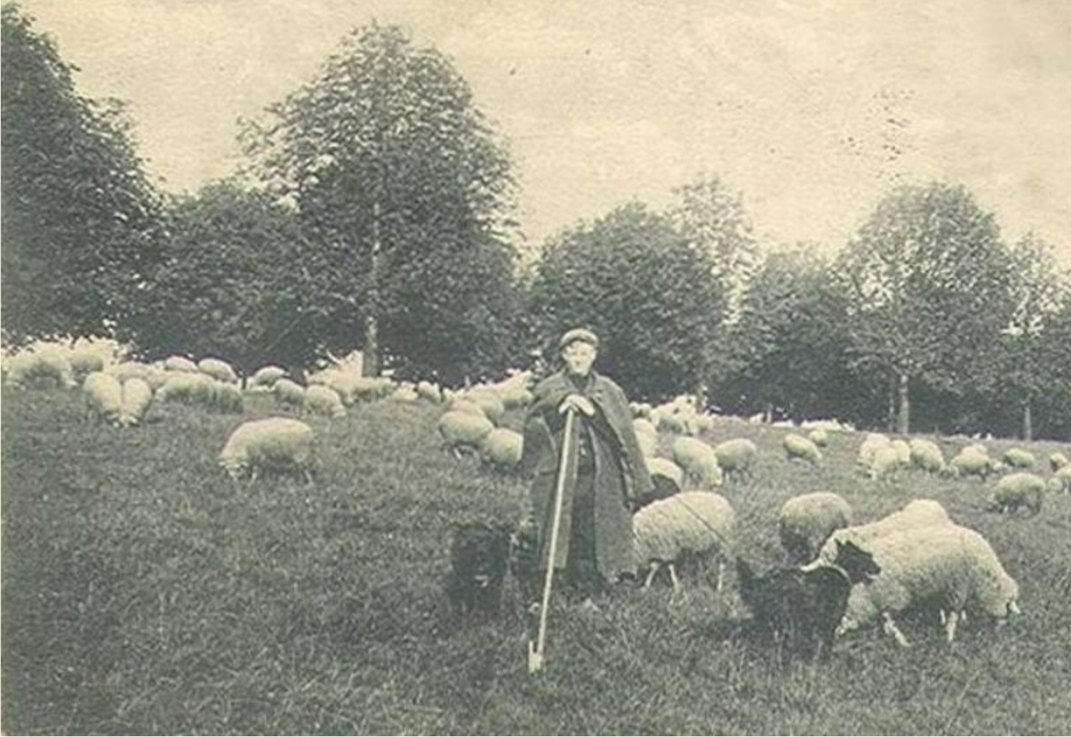
Afterwards, the dog brought the flock home again.