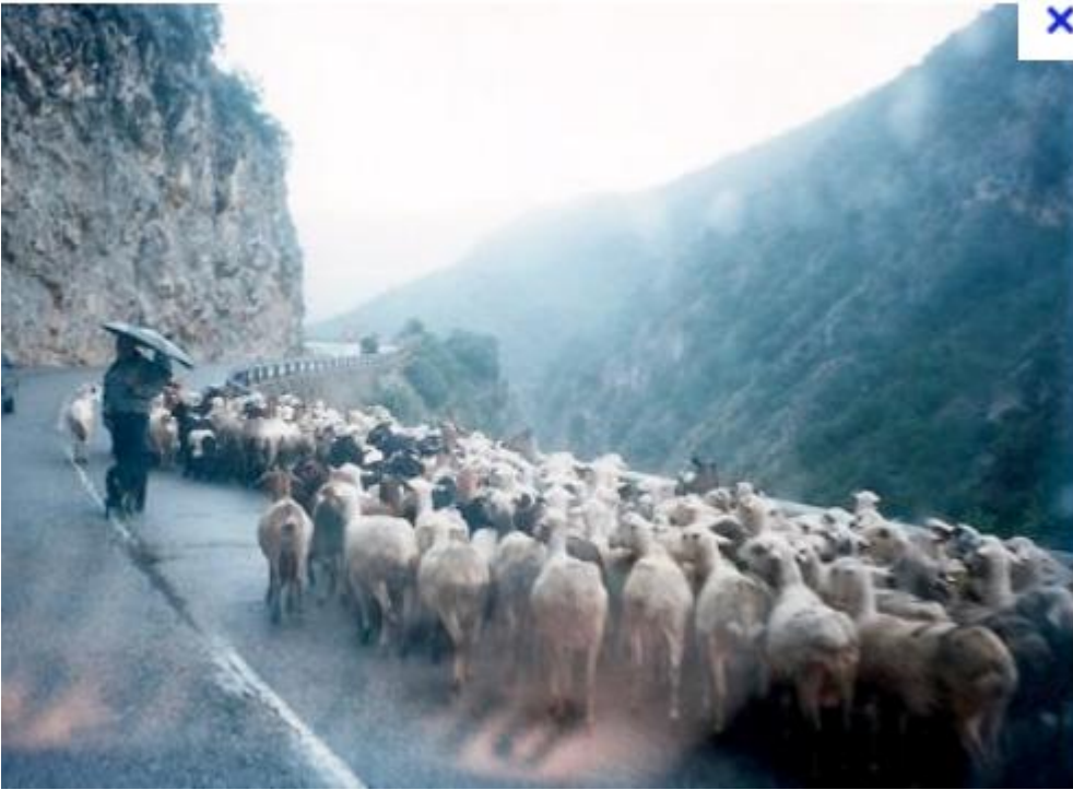
moving sheep on the highway in a downpour, Spanish Pyrenees