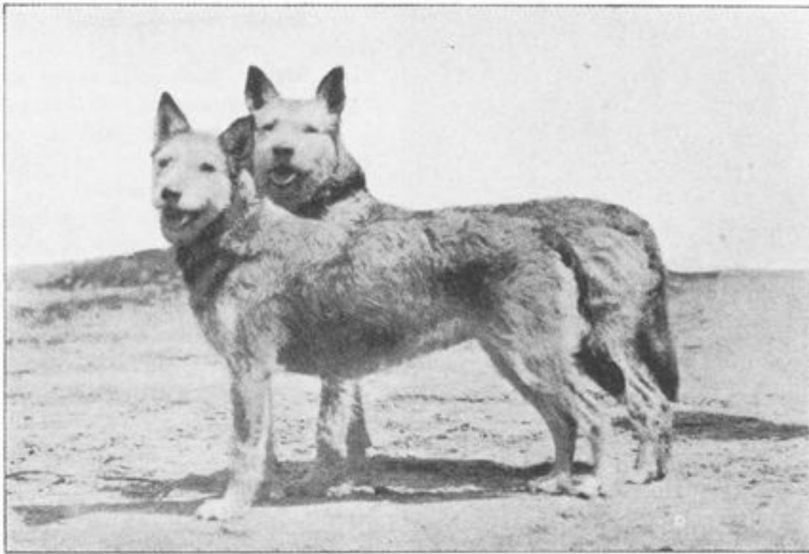
„Mira“ and „Bazoef“,