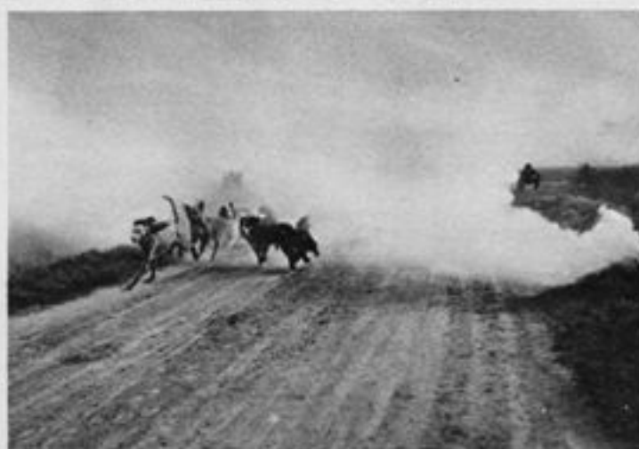
THE WONDERFUL TRAINING OF MESSENGER-DOGS: PASSING UNDETERRED THROUGH A SMOKE-BARRAGE.