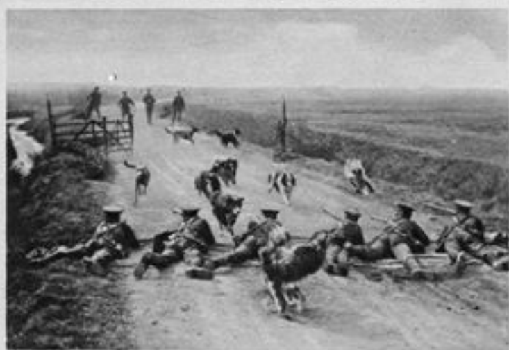
TRAINED TO FACE THE BULLETS: DOGS PASSING THROUGH A SQUAD OF SOLDIERS VOLLEY-FIRING.