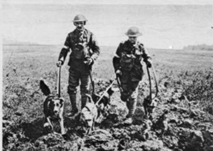
GOING ACROSS COUNTRY UP TO THE FRONT LINE: MESSENGER-DOGS WITH THEIR KEEPERS.