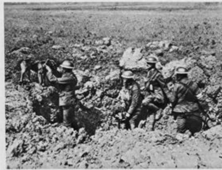
A MESSENGER-DOG DELIVERING A MESSAGE: AT A SHELL-HOLE USED AS A TEMPORARY POST.