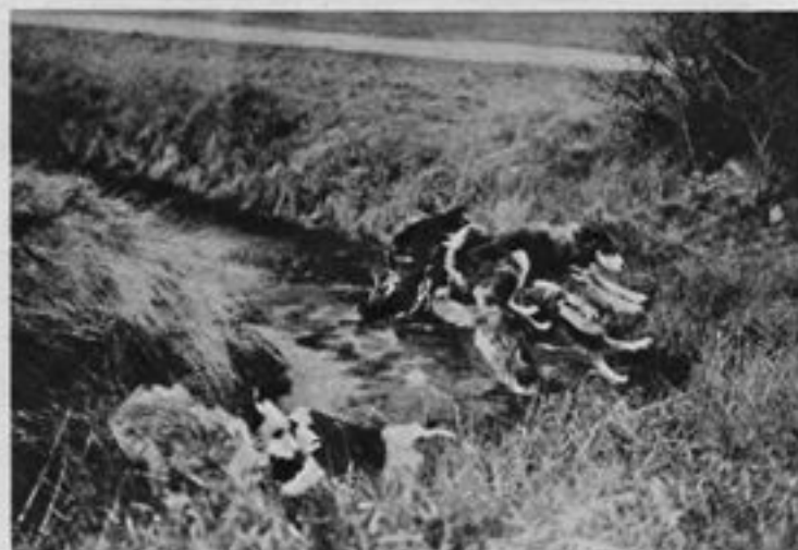
TRAINED TO CLEAR ALL OBSTACLES IN TRAVELLING ACROSS COUNTRY: DOGS CROSSING A DITCH.