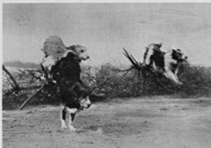
FASTER THAN ANY "RUNNER" IN CONVEYING DESPATCHES: DOGS JUMPING OVER BARBED WIRE.

Dogs have proved themselves extremely useful in war, for despatch-carrying and other purposes, such as scouting, sentry work, traction of light vehicles, and the tracking of wounded after action. The above photographs illustrate the training of dogs employed by the British Army for carrying messages. It will be seen that the tests to which the animals are put are severe, and no obstacles deter them. They can carry a message across country in much quicker time than any runner. In this connection it is interesting