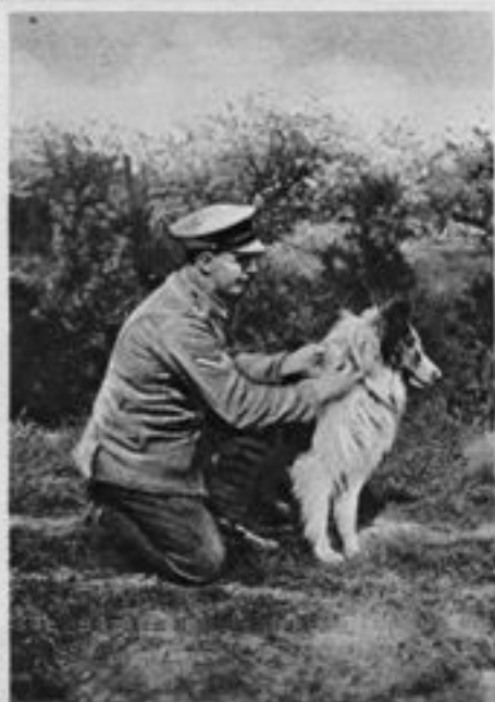
INSTRUCTIONS: A SIGNALLER PUTTING A DESPATCH IN A WALLET FASTENED TO THE DOG'S COLLAR.