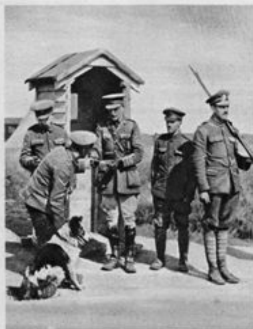
ARRIVED AT HEADQUARTERS: A MAJOR RECEIVING THE DOG'S DESPATCH.