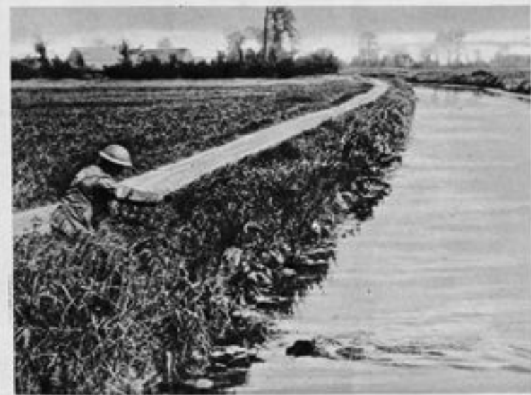
SWIMMING A CANAL TO DELIVER A MESSAGE TO HIS MASTER: A MESSENGER-DOG AT THE FRONT.