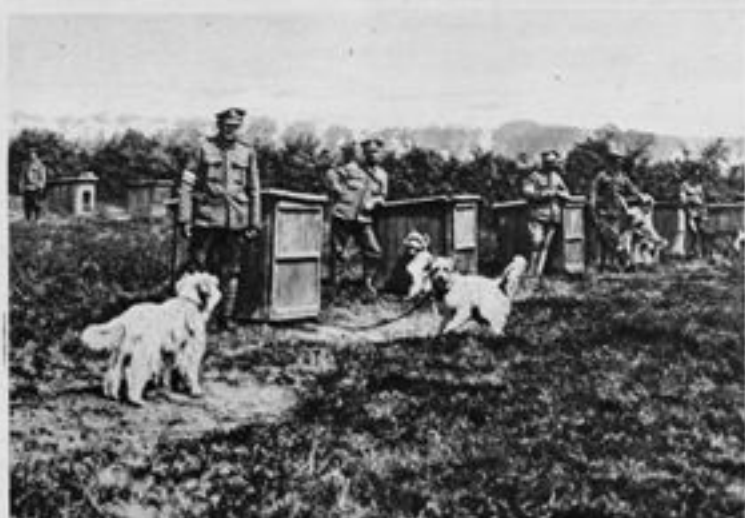
WAR-DOGS AT THE BRITISH FRONT: A MESSENGER-DOG BASE JUST BEHIND THE LINE.