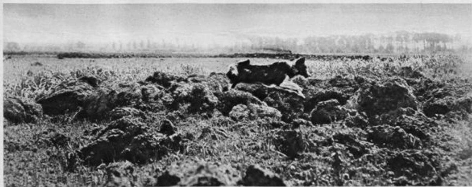
A WAR-DOG ON DUTY AT THE FRONT: JUMPING ACROSS SHELL-HOLES ON THE WAY BACK TO HEADQUARTERS WITH A MESSAGE.