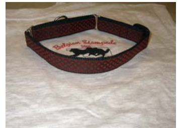
Celtic Knot black on red (above)