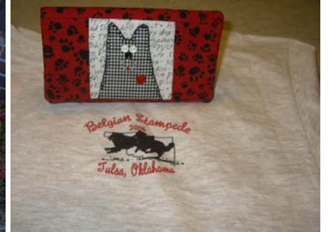
Ckbook (above) Chair (below)