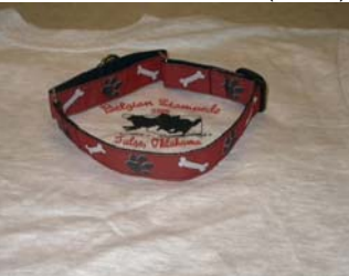
Paws & Bones (above)