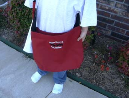
Tote (above) Chair (below)