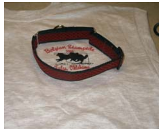
Celtic Knot red on black (above)