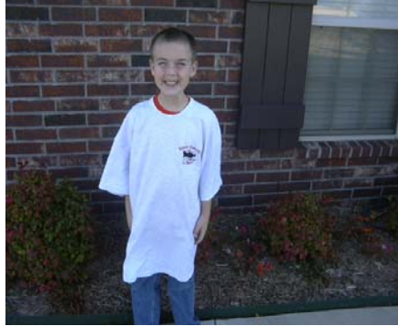
T-shirt (above & below)