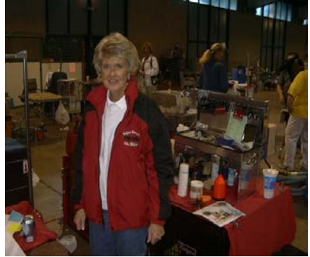
Jacket (above); Polo (below)