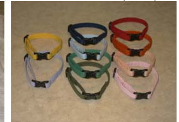
Set of 10 puppy collars